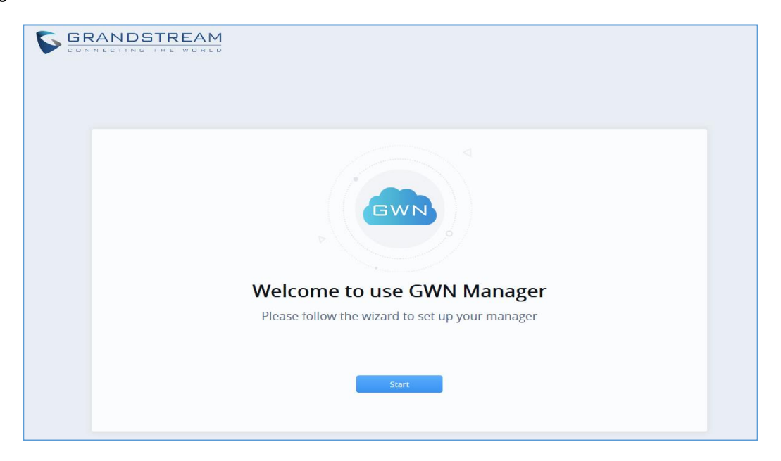
Figure 8: GWN Manager initial Web page

Below figures show the initial page after installation. On first use, users need to fill in additional information following the initiation Wizard. Click start to begin. For more detailed information please refer to the GWN Manager User Guide.