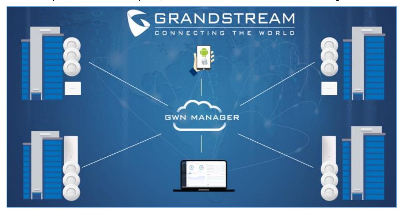
Figure 1: GWN Manager Architecture

GWN Manager is an On-premise Access Points Controller used to manage and monitor GWN Access points on your network. It provides an easy and intuitive web-based configuration interface, The GWN Manager can control up to 3000 GWN access points, from different models. Below is the GWN Manager architecture: